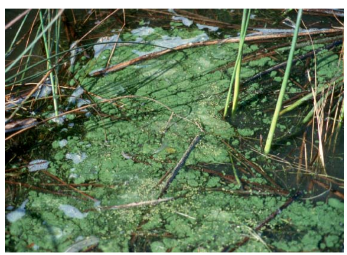
Cyanobacteria often clump together, particularly under calm conditions

Some species of algae can produce planktonic blooms. An example is diatoms that usually bloom in the spring, colouring the water shades of brown. A film of brown sludge on river rocks in early spring is usually left by diatom colonies. Euglenoids create a powdery film on the water's surface; some can turn the water bright green, similar to that of antifreeze. In intense light, euglenoid blooms shift from bright green to bright red, a pigment response to ultraviolet light stimulation.