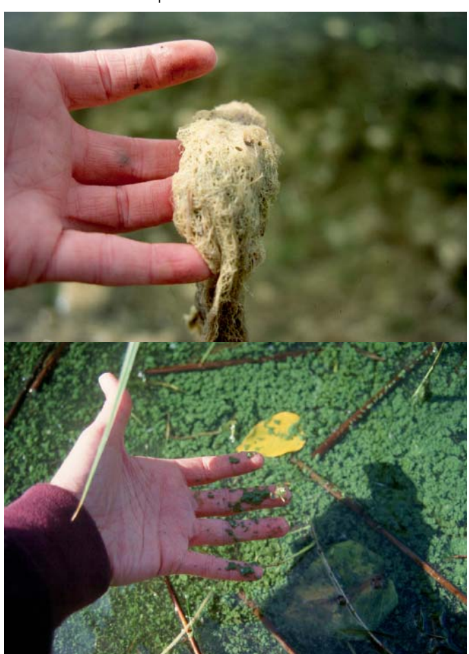
Top: Example of a filamentous green algae bloom

Bottom: Example of a planktonic cyanobacteria bloom